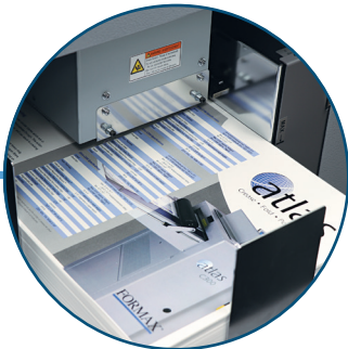
Upper-Belt Tri-Suction Feed Automatically elevates to separate printed sheets to prevent misfeeds