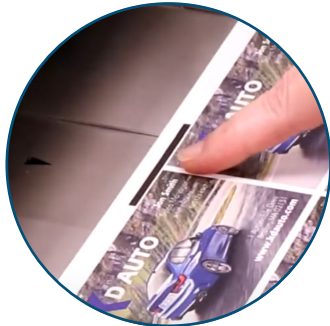
Cut-Mark Sensor Reads any image drift, then registers to ensure consistent finishing