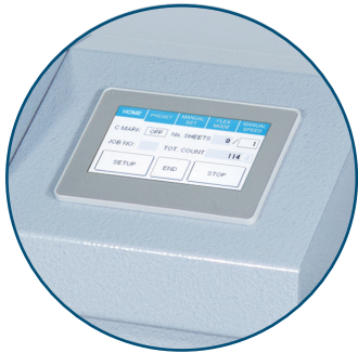
4" Color Touchscreen Program and make adjustments easily with graphics-based menus

The ATLAS-TRIO15 is ideal for on-demand finishing of jobs including business cards, postcards, brochures, and booklet covers. It slits, cuts, and creases in a single streamlined process , and handles sheets up to 13" W x 27.5" L , in weights up to 350gsm. The 4" touchscreen control panel allows users to store up to 150 custom jobs , and has three modes for operator convenience: Preset, Manual, and Flex mode for the greatest customization. Standard features include an automatically elevating feed table for accuracy, upper-belt tri-suction feeding system , double-feed detection , cut-mark sensor , side alignment guide , and two standard slitting guides. Custom slitting guides and a long sheet kit are also available.