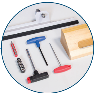
Blade Change Safety Tool Kit Change blade safely and easily, and make adjustments