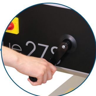
Spindle Guided Back Gauge Allows for fine adjustments in both inches and metric with LED display