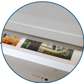
LED Laser Cut Line Shows where the blade will cut to make fine adjustments