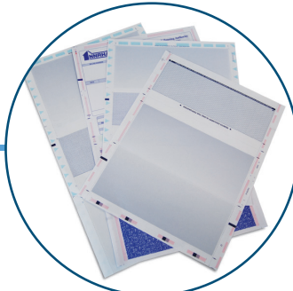
Compatible with Various Forms Processes forms up to 14” long, in Z, C, Uneven Z/C, Half & Custom folds