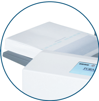
Drop-In Feeding System Produces dependable feeding of forms without paper fanning