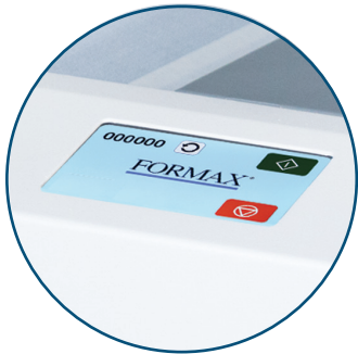
Color Touchscreen Control Panel Graphics-based and designed for easy, walk-up use

The FD 1406 AutoSeal® is a user-friendly low-volume solution for processing pressure sensitive mailers, frequently used for applications that can be printed on one sheet, including checks, invoices, school reports, and tax forms. It processes a variety of forms, up to 14” in length , at speeds of up to 73 forms per minute . Standard features include a graphics-based color touchscreen, drop-in top feed system, adjustable catch tray , and clearly marked fold plates that can be set for custom folds. Fold types include Z, C, Uneven Z and C, Half and custom. The FD 1406 is proudly built in the USA with proven Formax technology, and is ideal for any church, school, or small business looking to utilize the convenience of pressure seal forms.