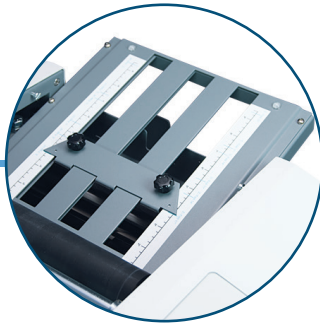
Clearly Marked Fold Plates Marked with five of the most popular folds