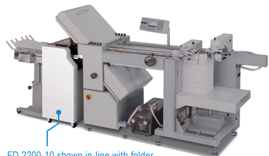
FD 2200-10 shown in-line with folder.