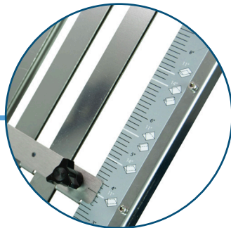
Clearly Marked Fold Plates Fold plates are pre-marked with four common fold settings