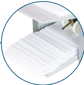
Output Conveyor & Stacker Wheels Stacker wheels can be adjusted for neat and sequential stacking