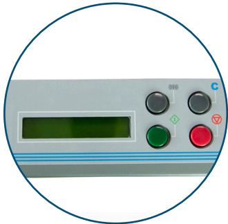
LCD Control Panel Features a 3-digit resettable counter with AutoBatch

The FD 314 Office Desktop Folder provides clearly-marked fold settings and push-button operation make it easy to use, right out of the box. It's capable of folding 11" and 14" paper at speeds up to 7,700 sheets per hour , with a hopper capacity of up to 250 sheets . Fold plates are pre-marked with four common fold settings letter, zig-zag, half and double parallel and can be easily adjusted for custom folds. The LCD control panel includes a resettable 3-digit counter , and AutoBatch for processing a set number of sheets with a pause between sets. The built-in output conveyor features easily adjustable stacker wheels for neat, sequential stacking of folded pieces.