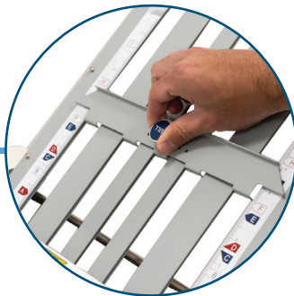
Pre-Marked Fold Stops

Skew knobs move feed table left or right to adjust for minor misalignments