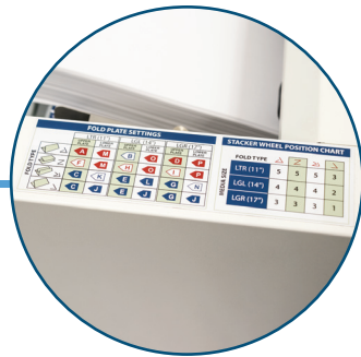
Intuitive Graphic Fold Guide

Neatly stack different paper sizes and fold types