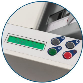
LCD Control Panel

The FD 324 Document Folder processes up to 8,600 sheets per hour and can accommodate paper sizes up to 12" x 18". Its removable fold plates are clearly marked with four common fold settings for Letter, Zig-Zag, Double Parallel, and Half Fold. The LCD Control Panel features AutoBatch , which allows users to process a specific number of sheets with a pause between sets, ideal for groups of flyers or mailings. In addition, the output conveyor includes easily adjustable stacker wheels for neat, stacking of folded pieces. The three-tire friction feed system accurately pulls paper into the folder, while the skew knob allows for moving the feed table left or right, to adjust for minor misalignments.