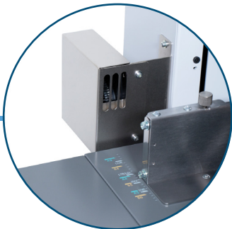
Side Air System Enhances feeding of heavy stock and large paper sizes