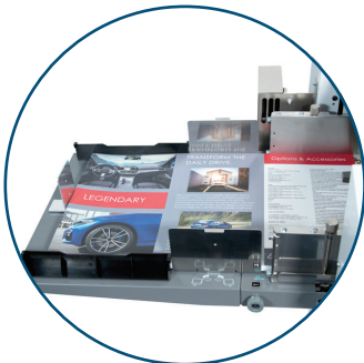
Extended Infeed Tray with Air Suction Handles sheets up to 25.5" long, using both optical and ultrasonic sensors