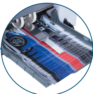
Outfeed Stacking Belt & Rollers Automatically adjusts to paper size, with two tray positions available