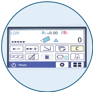
Color Touchscreen Control Panel Program and make adjustments quickly and easily

The FD 3302 Air-Suction Document Folder offers high performance folding in a compact tabletop unit . The air-suction feed technology reduces static electricity and minimizes feed marks common in traditional friction feed systems. With a speed of up to 18,600 sheets per hour , and a feed tray capacity of up to 625 sheets , the FD 3302 quickly powers through a range of applications, all at the touch of a button. It's designed to handle a variety of paper weights and sizes, up to 25.5" long . User-friendly features include automatic paper size detection and fold plate settings, a color touchscreen control panel , a four-digit counter with batch counting , six programmed fold settings , and the ability to store up to 30 custom folds .