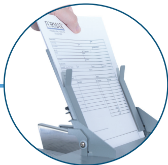
Optional Multi-Sheet Feeder Up to 4 stapled or unstapled sheets can be folded at once