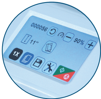
Color Touchscreen Control Panel Utilizes easily-recognized symbols in place of text

The FD 346 Document Folder is a fast, dependable, easy-to-use solution for virtually all folding applications. The color touchscreen control panel uses internationally-recognized symbols in place of text, making it easy for anyone to use. Six popular folds are clearly marked on the fold plates. Simply load the feeder with up to 500 sheets, and after folding, the FD 346 will hold the finished pieces on patented telescoping conveyor system . Additional features include AutoBatch for processing sets of documents, adjustable output stacker wheels , a cross-folding guide for two-pass operation, and the ability to set custom folds . The optional multi-sheet feeder allows up to 4 stapled or unstapled sheets to be folded at one time.