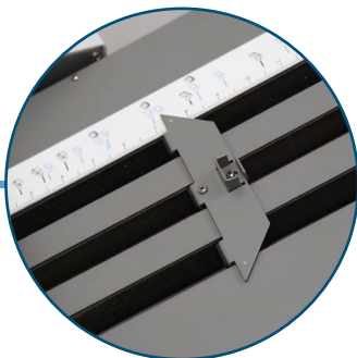
Pre-Marked for Standard Folds Fold plates are clearly marked for six popular fold types