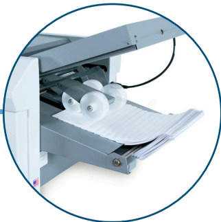
Adjustable Stacker Wheels Neatly stack different paper sizes and fold types